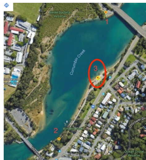
Currumbin Creek Bin Locations