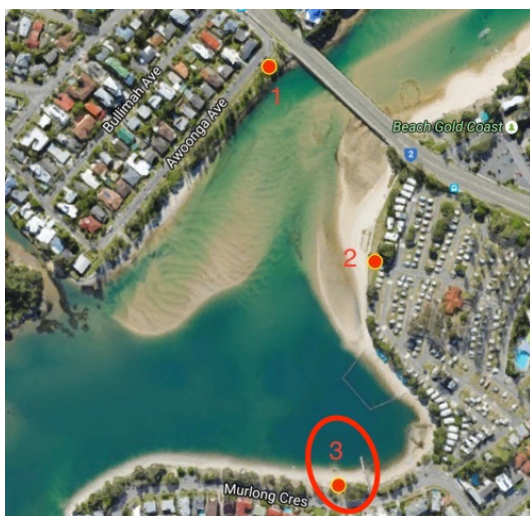
Tallebudgera Creek Bin Locations

After reviewing the data, we have decided to move two bins to new locations. These are Bin 3 at Tallebudgera, and Bin 3 at Currumbin. We will be trailing them in Robina (locations TBA).